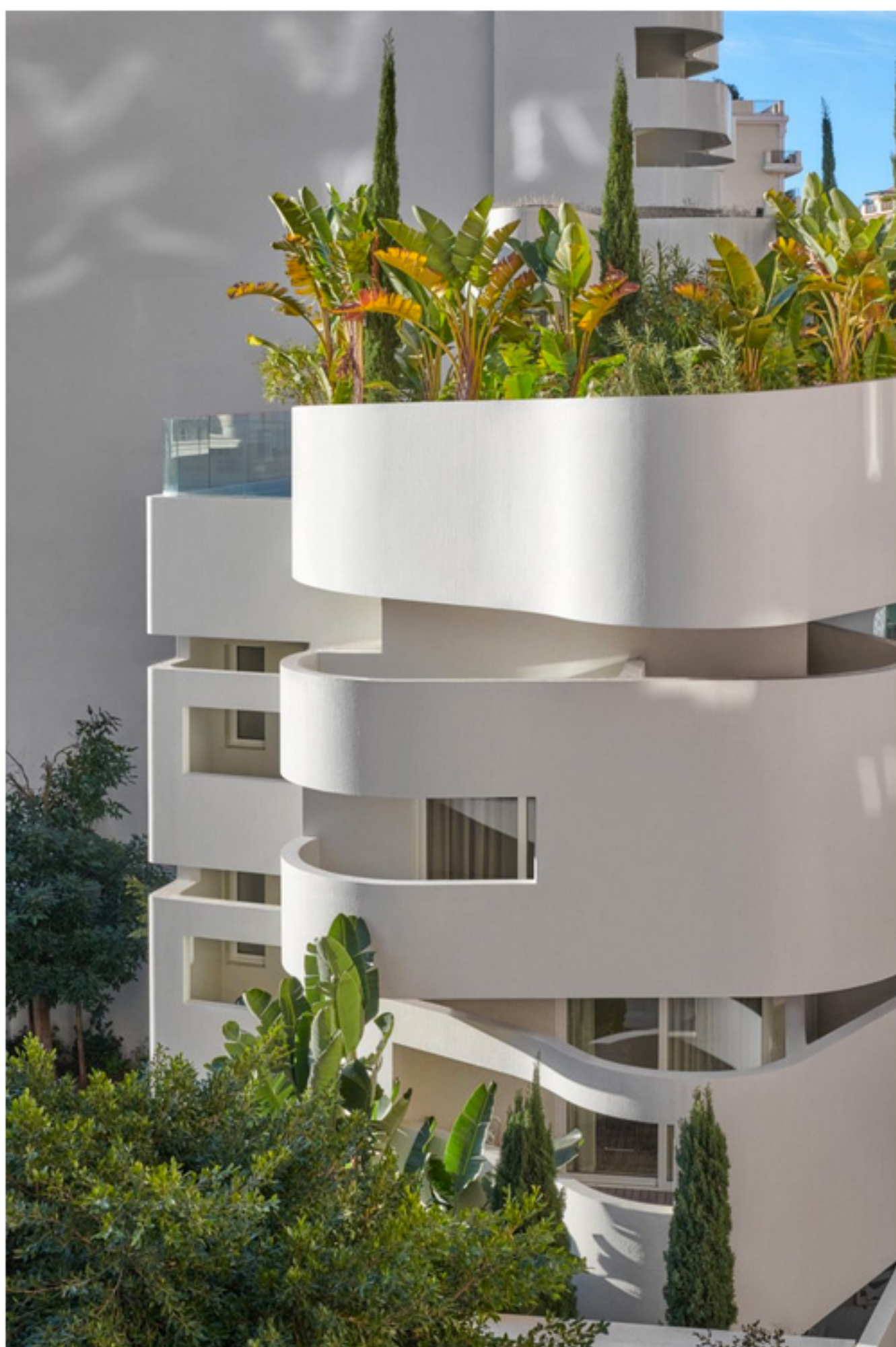
Villa Nuvola, designed by Jean-Pierre Lott

Stretching over 800 m2, the villa showroom displays “The art of German design” and, in cooperation with leading German brands, LenzWerk Monaco establishes tailor-made concepts for interior design. This approach is complemented with selected pieces of furniture from its own LenzWerk manufactory.