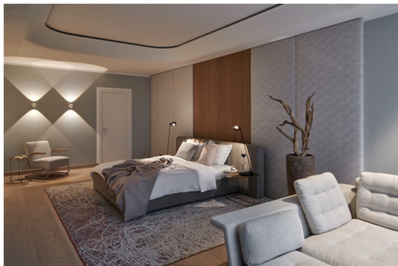
The LenzWerk bedroom