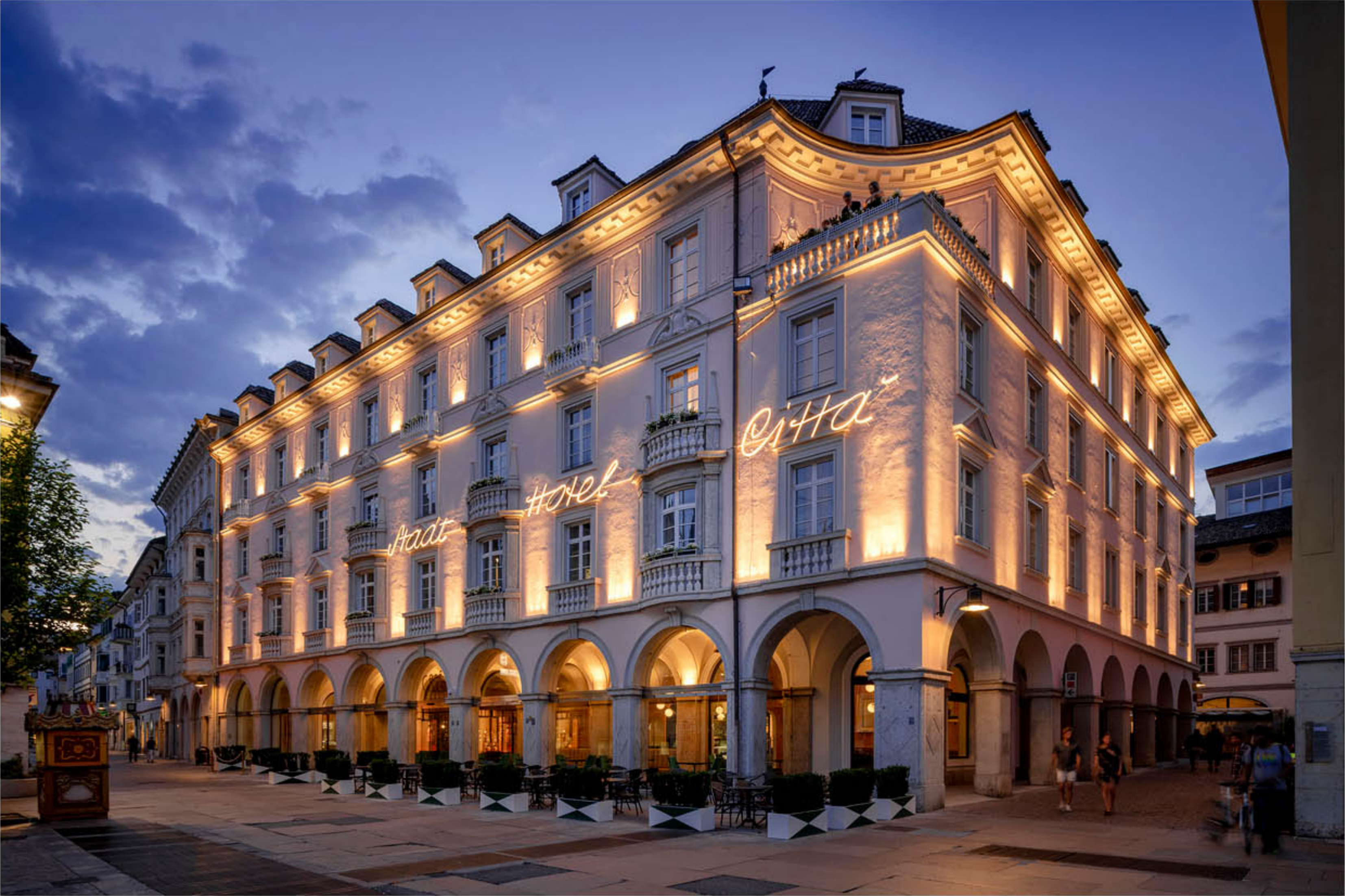
Stadt Hotel Città, Bolzano/South Tyrol, Italy

An historical Bolzano hotel restored to its former glory