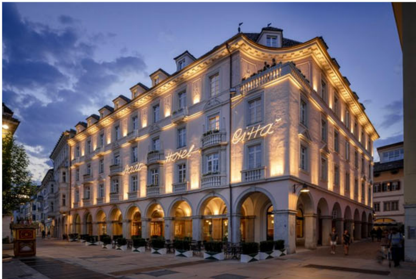
Stadt Hotel Città. Bolzano/South Tyrol, Italy

Located in the oldest part of Bolzano's historical center, Stadt Hotel Città has the feel of an elegant middle-aged gentlewoman waiting to be invited for a waltz. She knows all the steps. She's intimately familiar with the music. All she requires is a sure hand to lead her to the center of the parquet floor so that she can shine once more. And when all eyes are trained upon her, she'll be as cosmopolitan and dazzling as she was before, the center of attention.