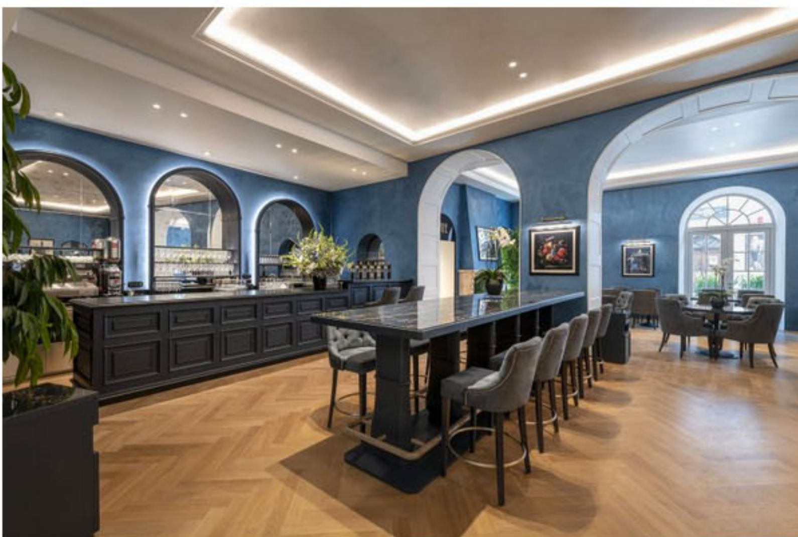
Brasserie with bar

And whereas Giovanni prefers the warm tones of the Moroccan sand dunes, Cellina looks out of the window, gazes at Piazza Walther, and takes in its colors, such as the many shades of green on the cathedral roof and the antique pink on the hotel facade. "The interiors will be colorful. After all, even at the end of the nineteenth century, each hall was a different color." On this, they are both in full agreement. Today, the interior of the Stadt Hotel Città shines in a color palette ranging from iridescent jungle green to tropical green, sage, teal and the enveloping midnight blue of the brasserie.