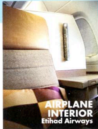
AIRPLANE INTERIOR Etihad Airways