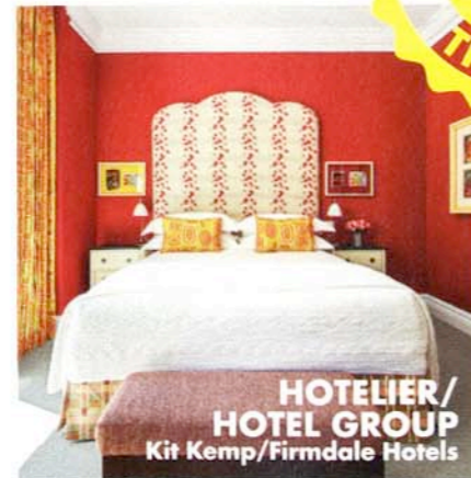
HOTELIER/HOTEL GROUP Kit Kemp/Firmdale Hotels