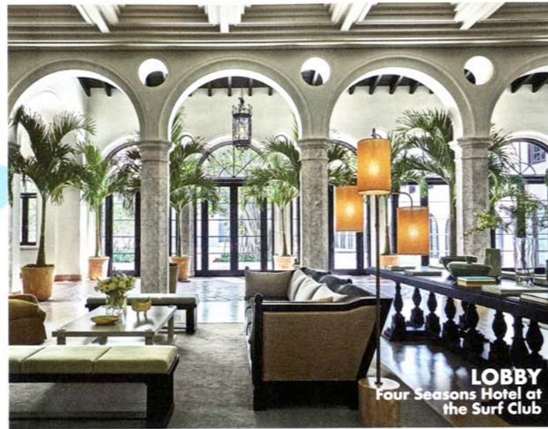
LOBBY Four Seasons Hotel at the Surf Club