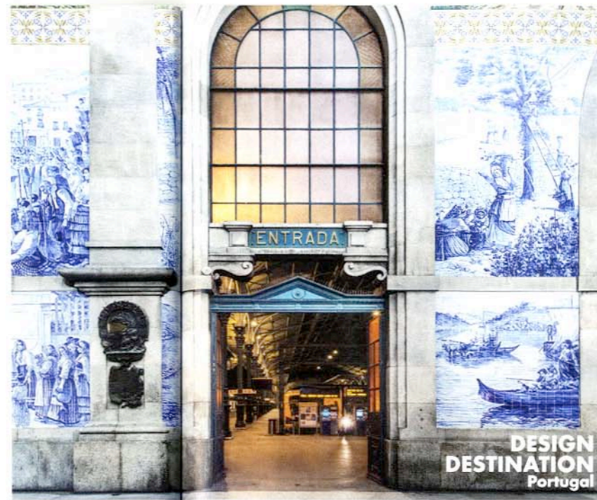
DESIGN DESTINATION Portugal