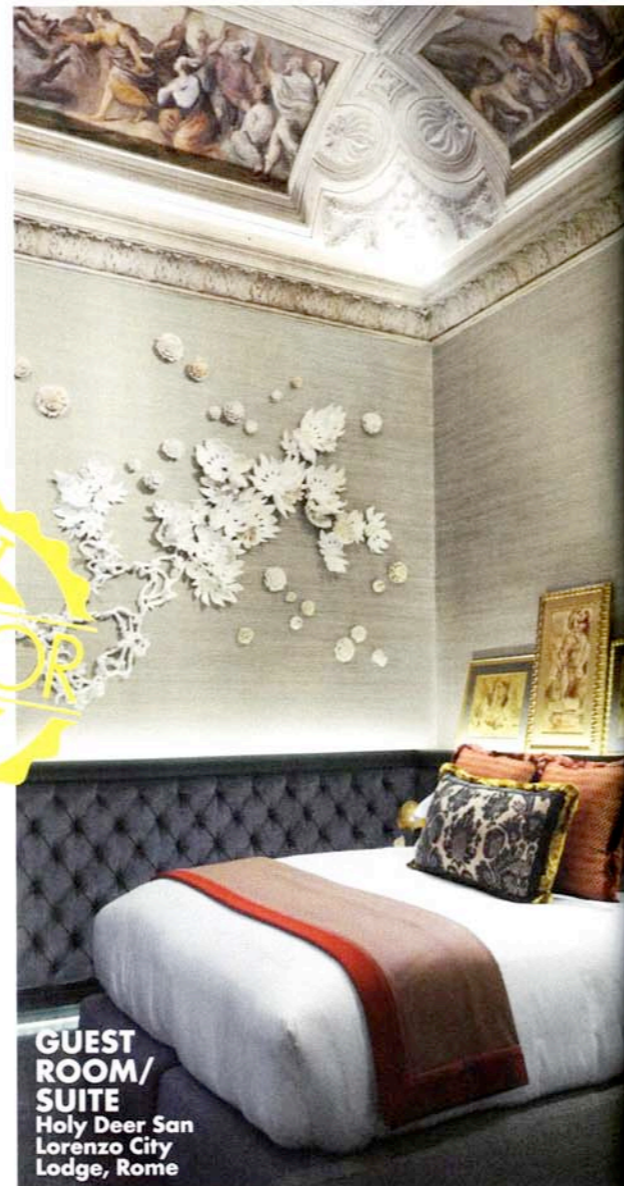
GUEST ROOM/SUITE Holy Deer San Lorenzo City Lodge, Rome