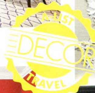
ILLUSTRATION: GETTY IMAGES; KIT KEMP; TIAGO MOLINOS; HOLY DEER; MATTHEW HRANEK (3)